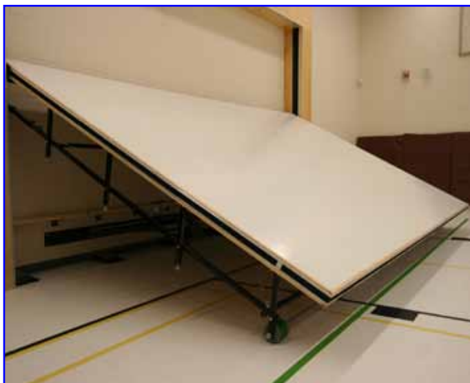
Retractable Stage partly closed